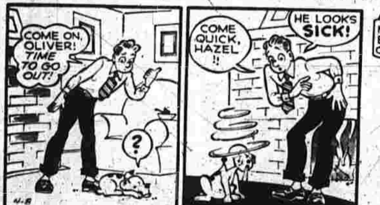
A Warming Performance BY AL VERMEER