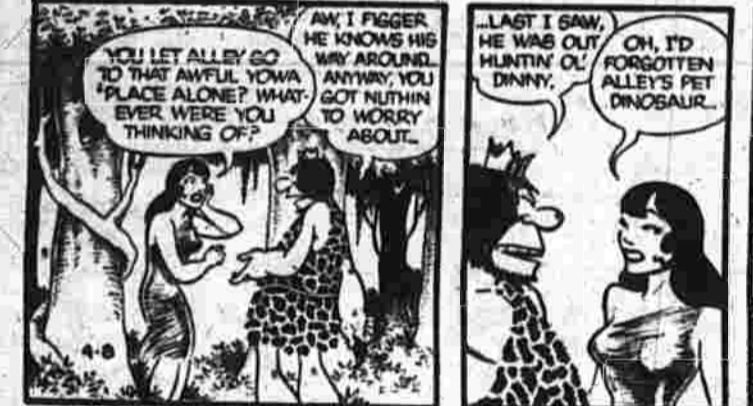
Riderless Steed BY V. T. HAMLIN