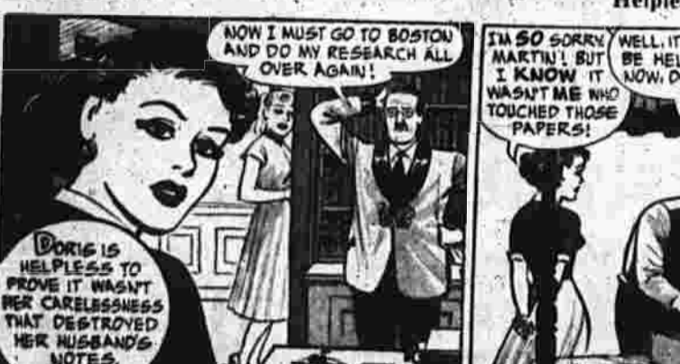
Helpless BY LESLIE TURNER